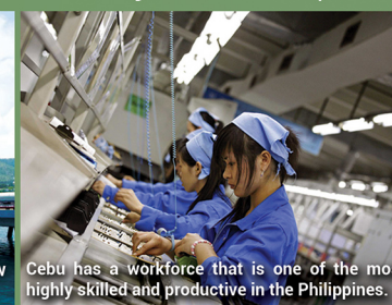
Cebu has a workforce that is one of the most highly skilled and productive in the Philippines.