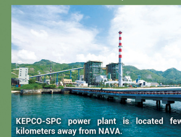
KEPCO-SPC power plant is located few kilometers away from NAVA.