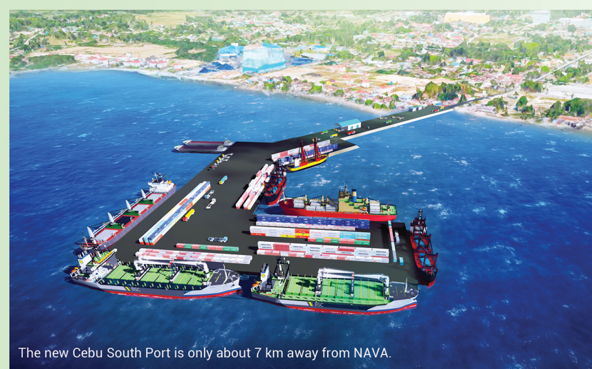
The new Cebu South Port is only about 7 km away from NAVA.

PEZA NAVA is a PEZA-registered economic zone.